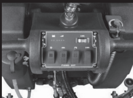
Easy-to-use, fingertip controls.