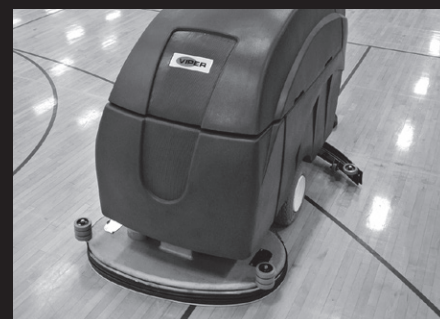
Engineered to withstand heavy, daily use in commercial applications such as schools, office buildings, and warehouses.